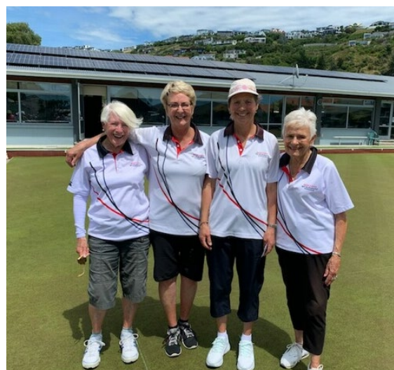
... and the winners!