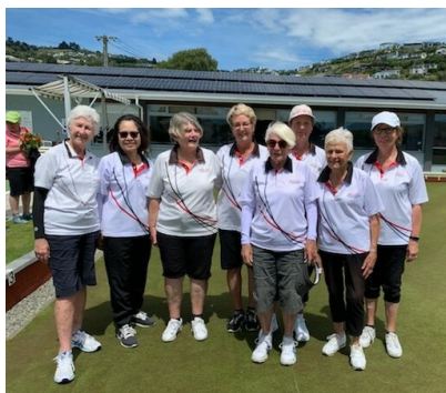
The finalists ...