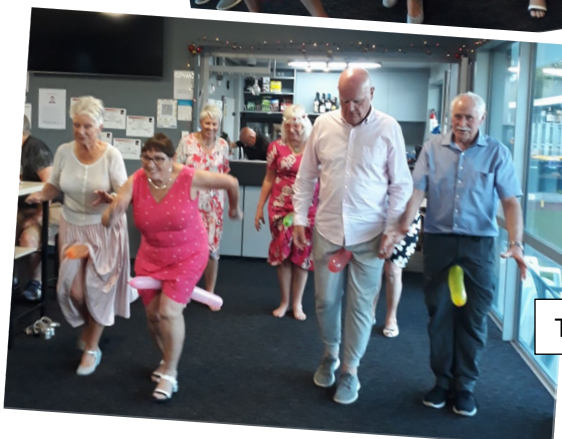
There was something to do with balloons...