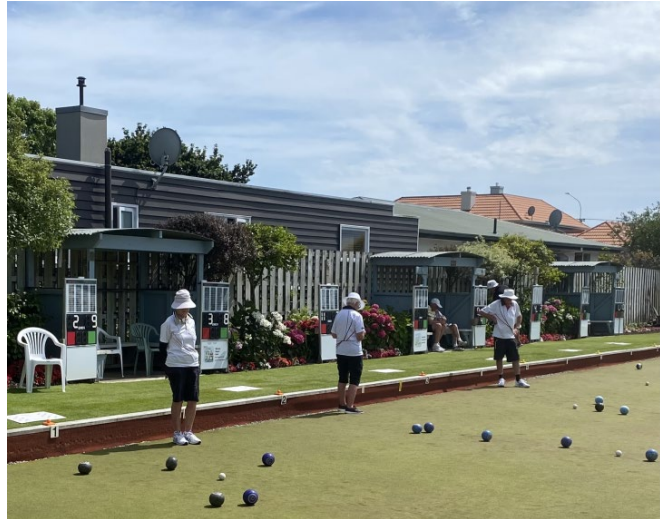
Two hot days and the second even hotter! A great job done by the markers.