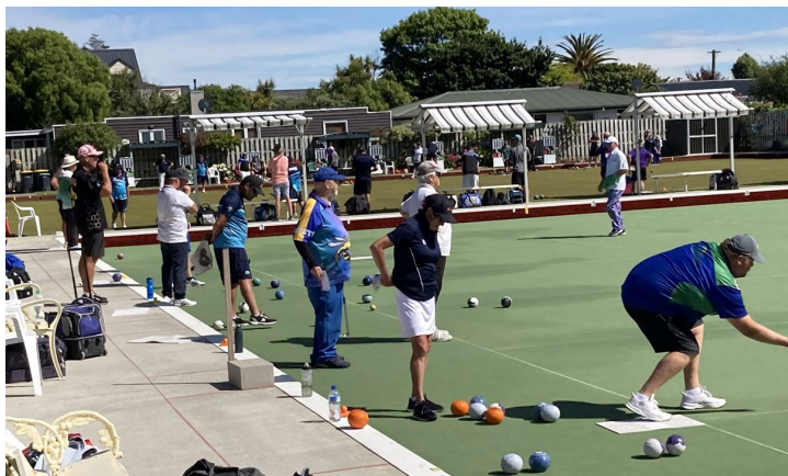
New Year Open Pairs ~ a great day and some superb bowling