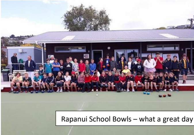
Rapanui School Bowls – what a great day