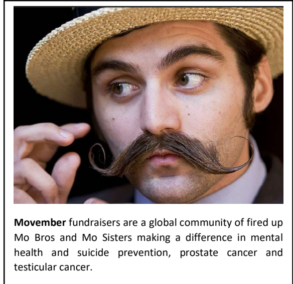
Movember fundraisers are a global community of fired up Mo Bros and Mo Sisters making a difference in mental health and suicide prevention, prostate cancer and testicular cancer.