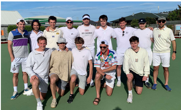
Redcliffs Senior Hockey team annual bowls competition